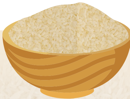
Indian Common Parboiled Rice