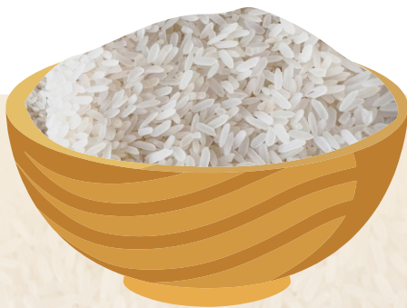
Indian Long Grain Parboiled Rice

To produce and supply the finest quality rice through innovative processes and advanced technology. To maintain long-term partnerships with customers and government agencies by ensuring reliability and excellence. To foster sustainable agricultural practices and support local farmers. To continuously enhance our production capacity and expand our reach to global markets.