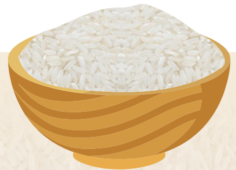
Indian Swarna Parboiled Rice